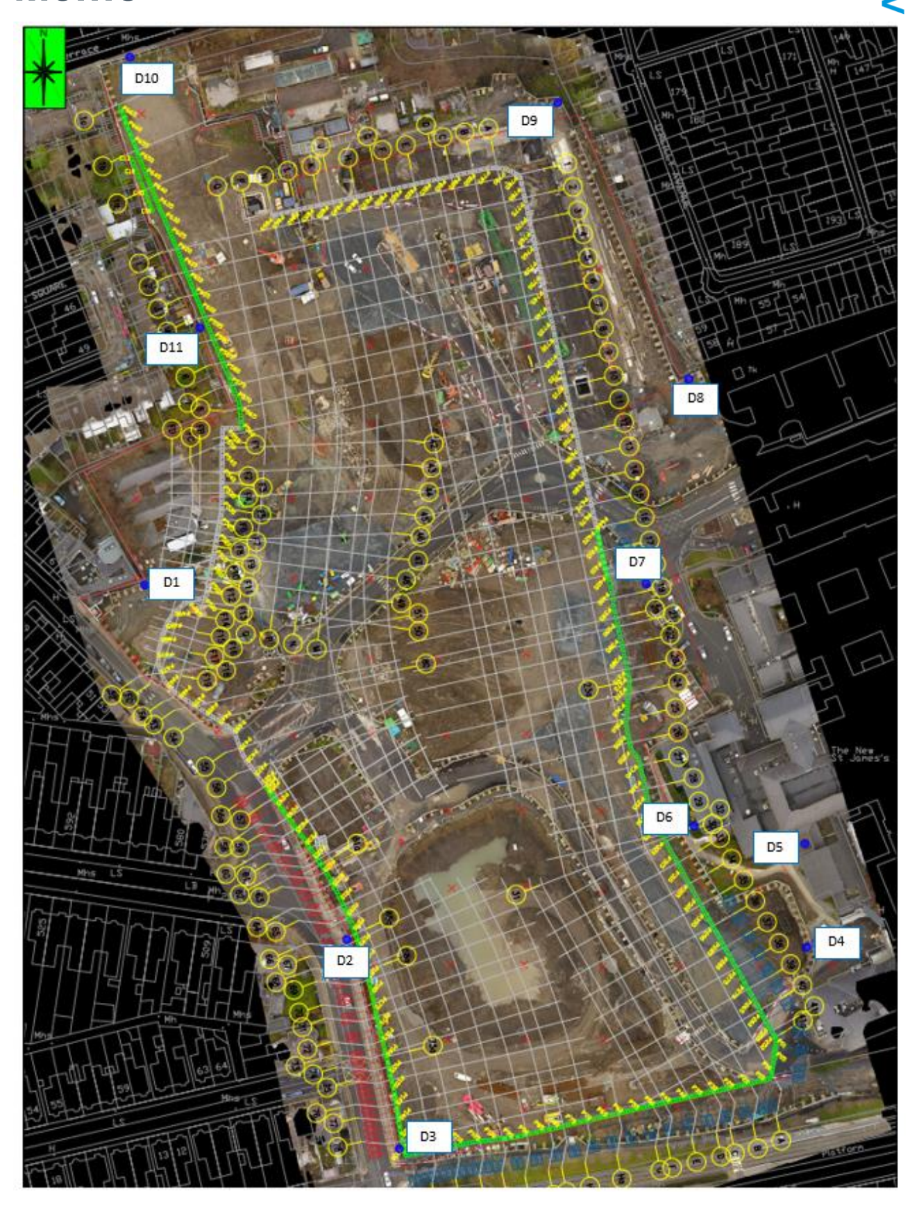
Figure 1. Location of Dust monitors on site (May 2018).