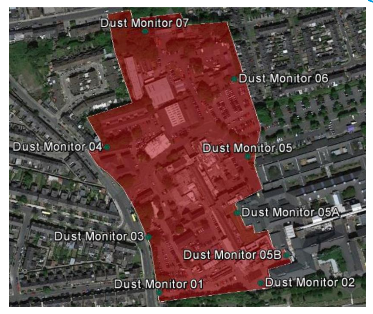
Figure 3. Previous location of Dust monitors on site (April 2017 to August 2017).